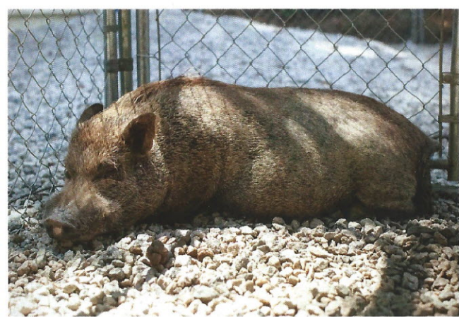
Our shelter will be home to countless unwanted dogs, cats, horses, pigs and other farm animals like Pansy.