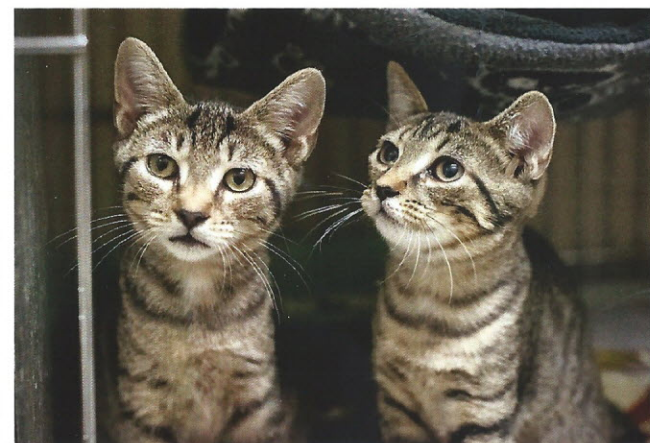
If you like felines and need some extra love, come cuddle or watch our cats and kittens play on their exercise wheel.