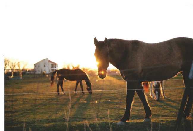
We work heavily with horse rescues and recently built a new pasture to house the horses in our care.

“THE LOVE FOR ALL LIVING CREATURES IS THE MOST NOBLE ATTRIBUTE OF MAN.”